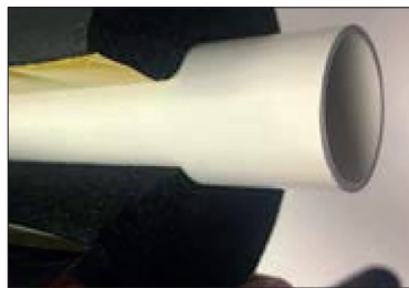
STEP TWO Wrap around the pipe, peel away yellow cover and seal together. Use the adhesive flap to secure.