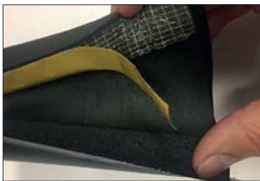
STEP ONE Open the pre-slit insulation.