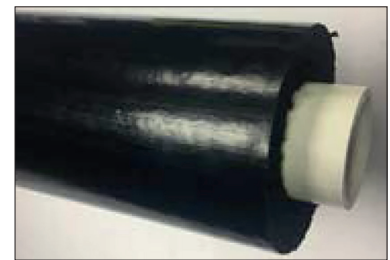
STEP THREE Condensate pipework is now fully protected with NEW pre-slit weatherproof insulation