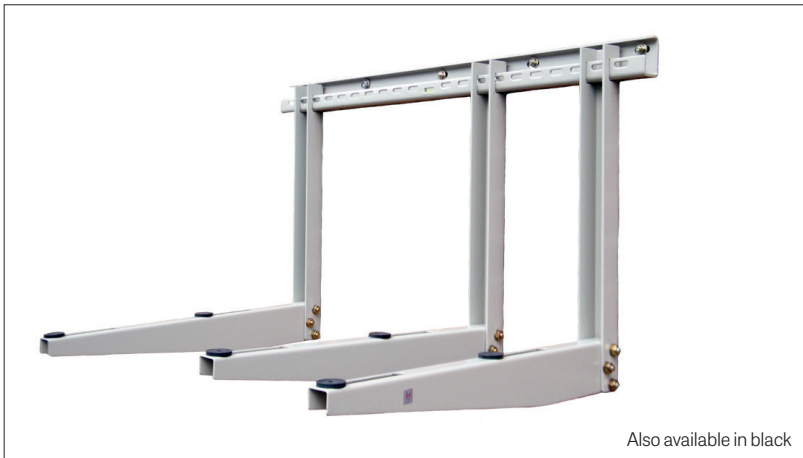
Also available in black

These flat-packed, self assembly brackets provide a professional finish to the installation of wall mounted outdoor condensing units and air source heat pumps. The Type 2 brackets have a crossbar allowing the uprights to be spaced exactly as required, and include wall spacers to help level the unit on uneven walls. All components receive a powder coating, with a scratch resistant, textured finish in a colour (RAL 7032) to match most brands of condensing units and domestic air source heat pumps.