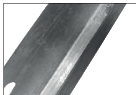
PROCESS TWO Zinc phosphating process multi stage cleaning and dipping chemical zinc